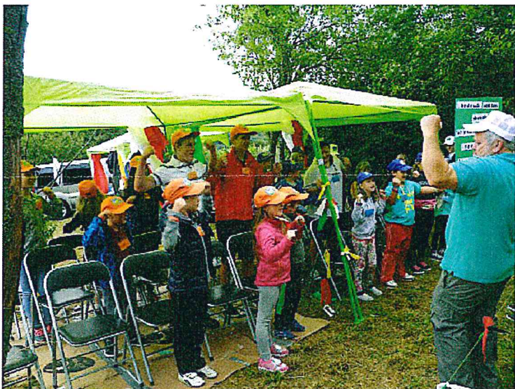
Bible Camp Singing!