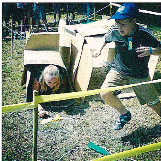
Obstacle Course Fun – They Loved It!