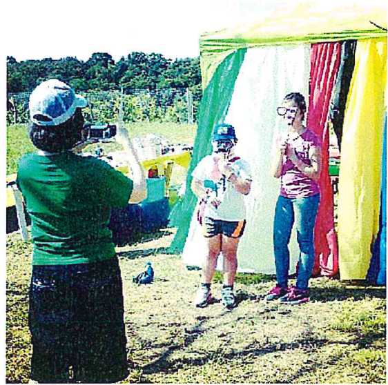
Fun Photos for the Kids