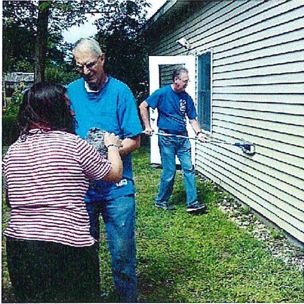
Hard at Work Cleaning