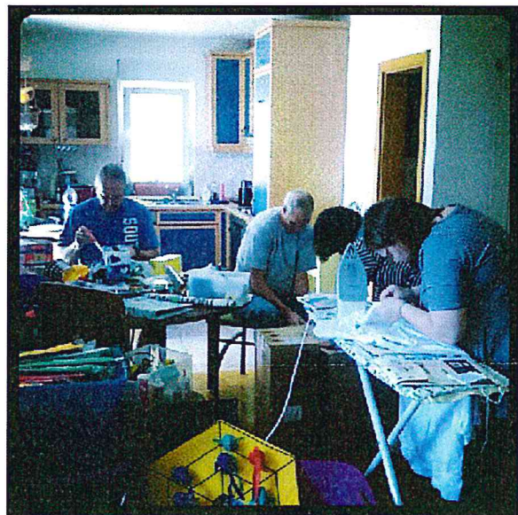
Hard at Work for Bible Camp